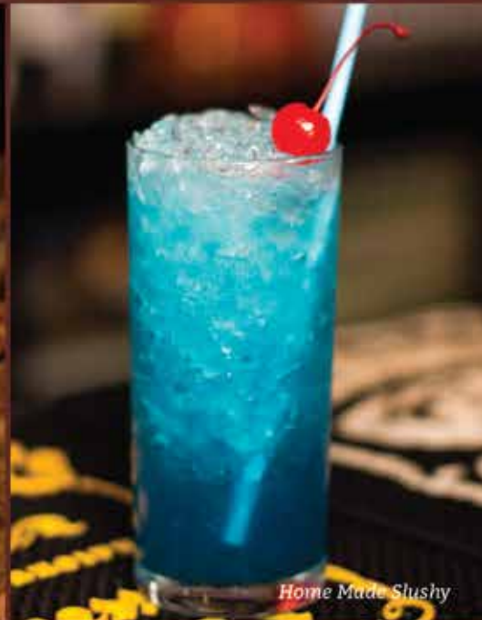
Home Made Slushy