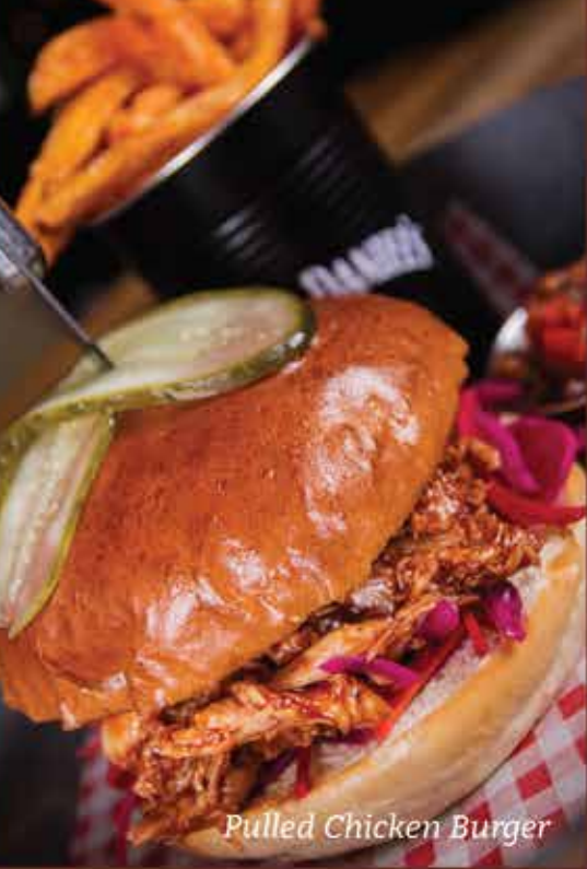
Pulled Chicken Burger