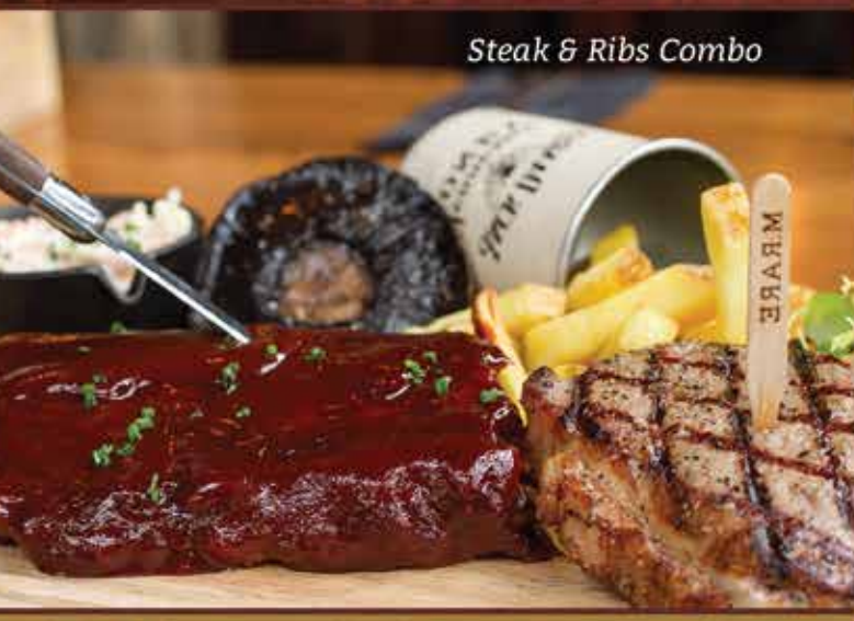
Steak & Ribs Combo