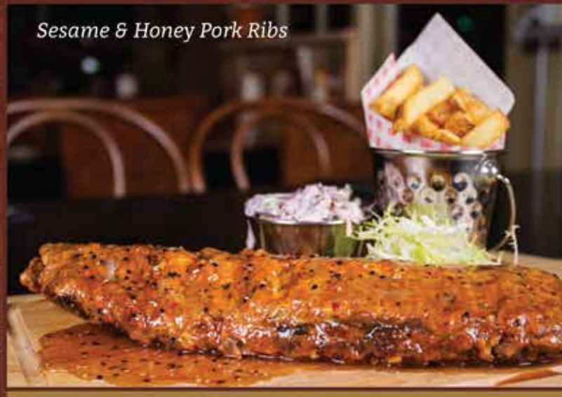
Sesame & Honey Pork Ribs

A full rack of baby back pork ribs covered in a Smokey's twist to the popular buffalo sauce, our one is made from crushed chillis, sweet peppers, distilled vinegar and some of Smokey's own special ingredients served with oriental slaw and fries