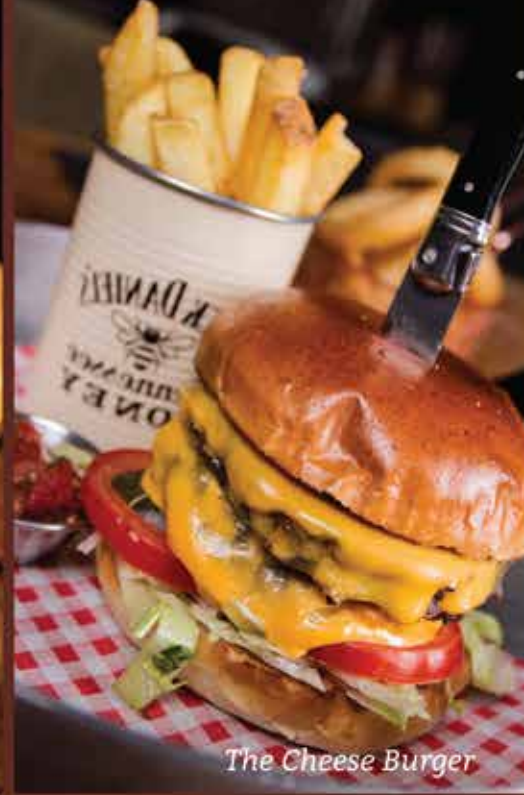
The Cheese Burger