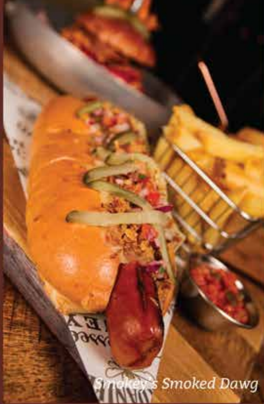
Smokey's Smoked Dawg